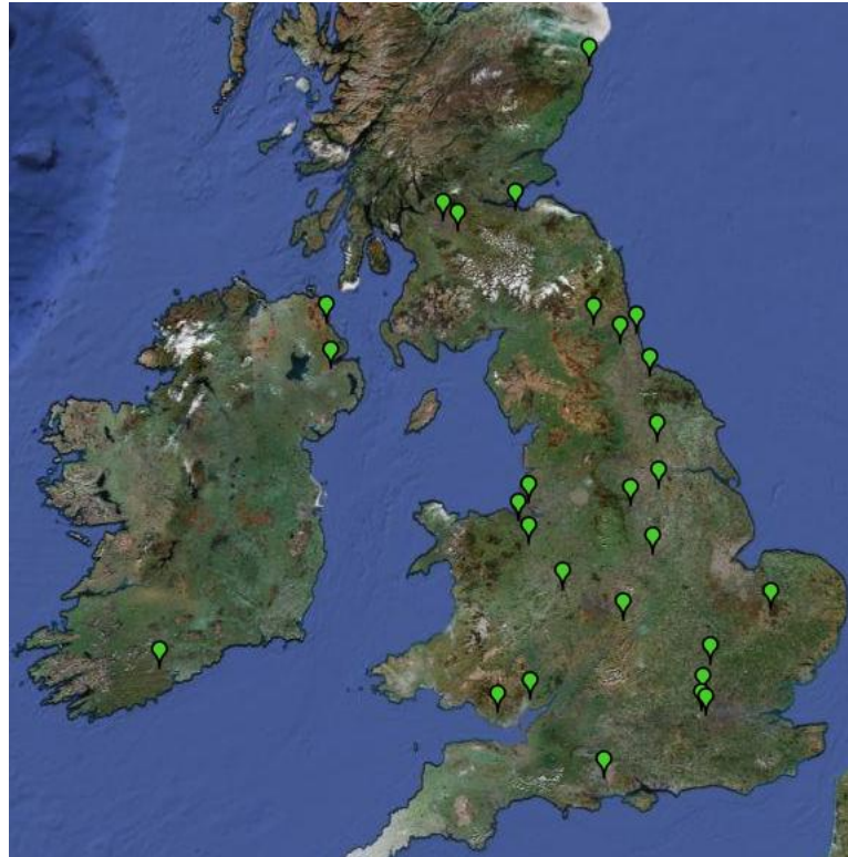
No narrative PP used

It is abundantly clear that there is no real geographical grouping, and that the spread of the form is in pan-British. The narrPP is used by speakers from Scotland, Wales, the Republic of Ireland and across England from north to south. The only areas which appear not to manifest narrPP are the South-West and East Anglia, but this is due to a sampling effect introduced by the random choice of examples. The same kind of patterning holds true of those speakers from the corpus who manifested no use of the narrPP.